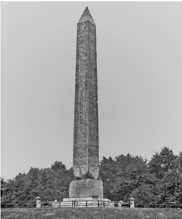
The Egyptian obelisk called Cleopatra's Needle stands in Central Park. It dates from 1600 B.C.

The Egyptian obelisk known as Cleopatra's Needle stands in Central Park in New York City. This obelisk is part of Babylonian worship and was the Tower of Nimrod which supposedly reached high to heaven to bring down the power of God-Baal, or Baal-Zebub, lord of the (heavenly) habitation to their worshipers.