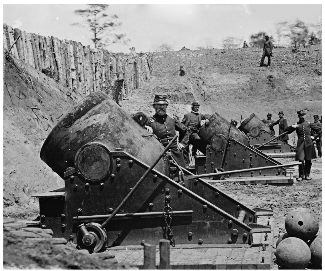
seige artillery, 1862

Remember, according to the Prophecy, written about 607 BCE, all of the previously shown means of war and travel would change in this generation. Knowledge would be increased. We would go from the power of horses to nuclear power that can darken the sun. It has all come to pass in this generation. Read again: