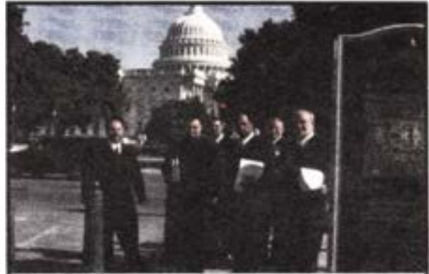
Members of The Peaceful Solution Delegation in Washington, DC