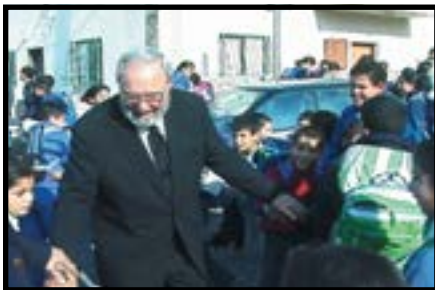
...sharing a special moment with Arab children in Nbillen, Israel.