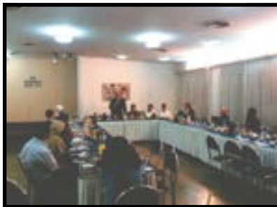
...speaking before a group of teachers in Haifa, Israel.