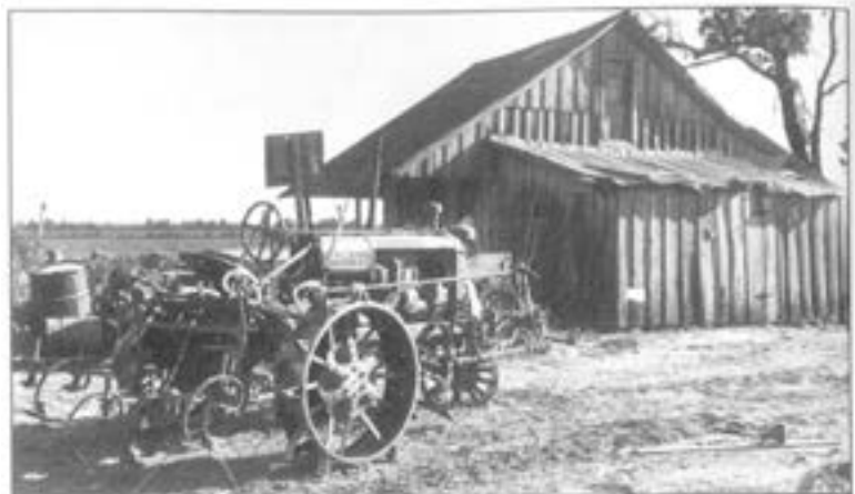
(left) A migrant's family's truck, loaded with all their possessions; (above) The tractor and house of a farmer in Oklahoma