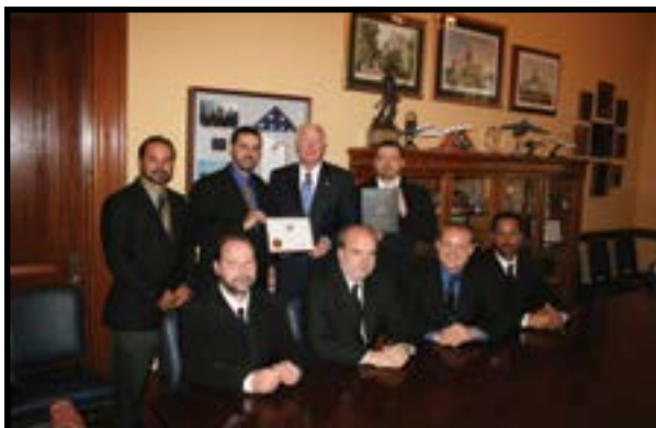
Members of The Peaceful Solution Delegation with Senator Saxby Chambliss— Washington, DC