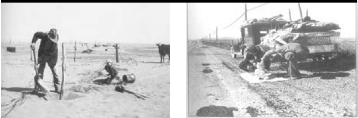
(left) An Oklahoma farmer and his son raising the height of a fence to keep it from being buried by drifts of blowing soil. (right) A family pulled over to the side of the road on their way to California after leaving the Dust Bowl.

I don't know how many sermons I've given on that, hidden in Oklahoma, hidden in Oklahoma for an appointed one thousand two hundred and sixty day time period clothed in darkness. That's where He hid me and the reason He hid me and my mother, my family, was for the purpose of that Work.