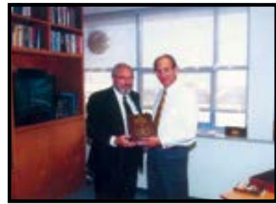
...with former Israeli Prime Minister Ehud Olmert.

“The door is opened to us brethren. We need to get ready. There are so many things we have to do in order to accomplish this task and make it successful. You can be a part of it. Any part at all is a part. Whether it’s the least to the greatest, your name will be listed as those who did the work...”