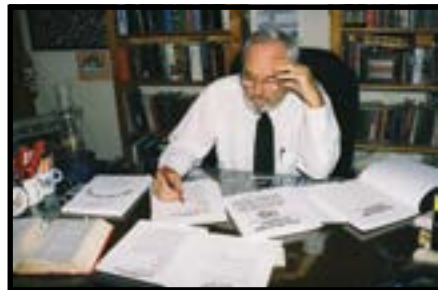
...working hard proofreading.