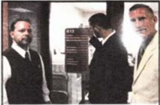
Members of The Peaceful Solution Delegation at Georgia Congressman Calvin Hill's Office: 613!