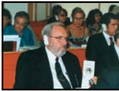
...at the Millenial Summit in Rome.