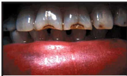
Hutchinson's teeth - peg-shaped upper incisors

The cutaneous lesions predominate and are often prominent in the plantar region. Bullous and vesicular lesions may also occur. Early congenital syphilis may include bilateral symmetric mucous patches, snuffles (a profuse nasal discharge containing large amounts of Treponema); osteochondritis or periostitis in the long bones (seen in 75-100% of children and therefore a good diagnostic indicator seen on X-ray) evidenced as a moth eaten appearance at the distal ends of bones.