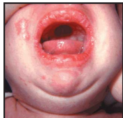
Runny nose (rhinitis) known as snuffles, a macular rash and mucus patches

Some of these lesions may resemble the wart-like lesion of adult syphilis. A small percentage of infants have a watery nasal discharge (snuffles) and a saddle nose deformity resulting from infection in the cartilage of the nose. Bone lesions are common, especially in the upper arm (humerus).