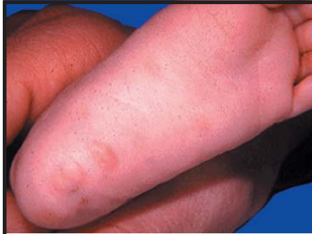
Bullae and a vesicular rash on the sole of the foot