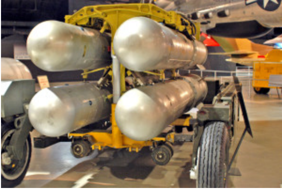
DAYTON, Ohio – Mark 28 Thermonuclear Bomb on display at the National Museum of the U.S. Air Force.