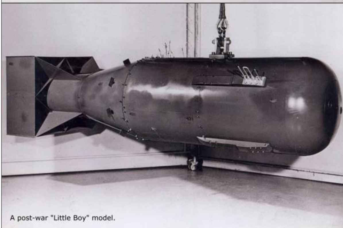
A post-war "Little Boy" model.

We are in the last part of this generation that started with the year of my birth, 1934.